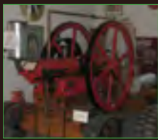
Rural Heritage Center