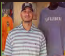
Join the Downtown Team