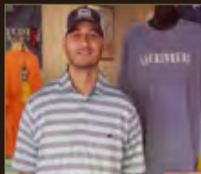
Join the Downtown Team