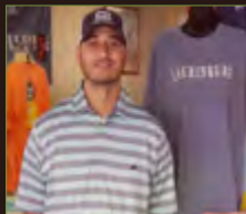
Join the Downtown Team