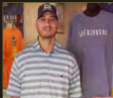
Join the Downtown Team