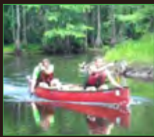
Chalk Banks Challenge

The series of spring festivals conclude with the Chalk Banks Challenge and Water Festival. The fun will be held on Saturday, May 18th from 9:00 a.m. – 2:00 p.m. at the Chalk Banks Access Area - Lumber River State Park in Wagram, NC. Contestants may compete in the ever-popular home-made raft race, a 5K trail run, youth run, a men's high heel sprint sponsored by Jerry's Deli, and much more.