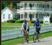
Biking Scotland County