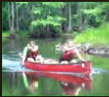
Chalk Banks Challenge