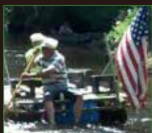
Chalk Banks Challenge