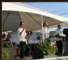
Laurinburg After Five