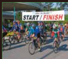
LaurelFest / Bike to Build