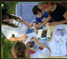
Fund Run / Arts Festival