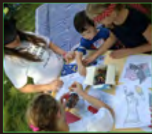
Fund Run / Arts Festival