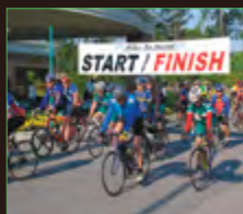
LaurelFest / Bike to Build