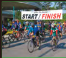
LaurelFest / Bike to Build