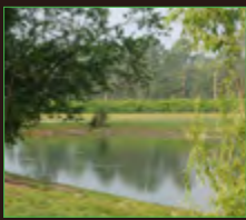
Cypress Bend Vineyards