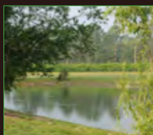
Cypress Bend Vineyards