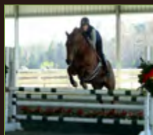
Scotland County Events

Come out and enjoy the people and good times of Scotland County – The Soul of the Carolinas.