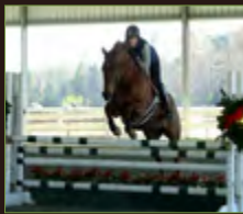
Scotland County Events