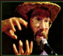
StoryTelling Festival Oct. 7