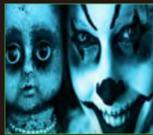
Insanitarium Oct 20, 21, 28, 31