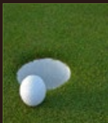
Golf Scotland County

(910) 276-0169 www.scotchmeadowscountryclub.com